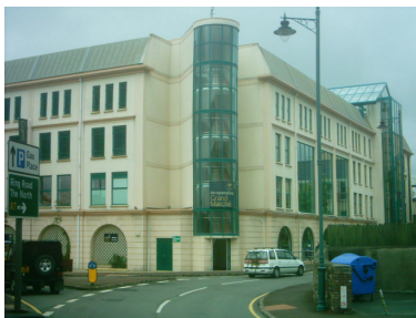
Grand Marche Centre- St. Helier

The new system went live, in conjunction with the opening of the new 'Homemaker' store on what was previously the first floor of the car park, on the UK bank holiday, Monday the 30 th August 2010, and has been working very well in catering for the increased customer demand for the reduced number of parking spaces. As part of the system launch, explanatory leaflets (copy attached) and signage were produced for customers of the centre.